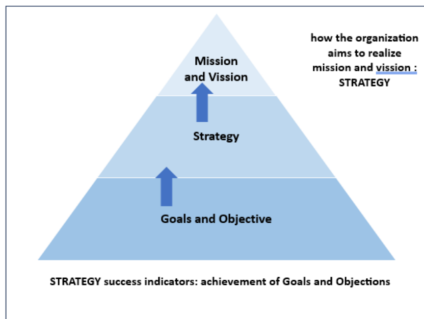
Figure 2 Strategy in Accordance with Planning.

So it can be concluded that strategic management is the design and implementation of organizational goals by organizational management. Generally, design begins with an evaluation and assessment of existing resources, an industry analysis to assess the competitive environment in which the company operates, and an assessment of internal operations. This evaluation and various assessments are used as material for preparing strategies to achieve organizational goals. The implementation of the designed strategy aims to direct and align the company with its main goals.