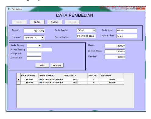
Figure 4.8 Purchase Form Display

The purchase form is used to input goods/fertilizer procurement transaction data. To use this purchase form, first click the "New" button because all the columns cannot be filled in in the initial display, the invoice column that is disabled is the new invoice number or invoice number, after the "New" button is clicked all the columns will be active and ready to be used. fill in and can save new purchase data. Click "Save" if all data has been completely filled in. Click "Cancel" if you want to cancel data input, "Refresh" to update the database. To delete, type the item code, the data will automatically appear, then click "Delete".