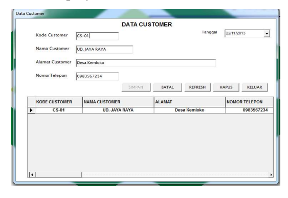
Figure 4.7 Customer Form Display

The Customer Form is used to input existing customer data and is used in every transaction. To add new customer data, type the customer code, customer name and the next data follows. "Save" if all data is complete. Click "Cancel" if you want to cancel data input, "Refresh" to update the database. To delete, type the item code, the data will automatically appear, then click "Delete". ". And as