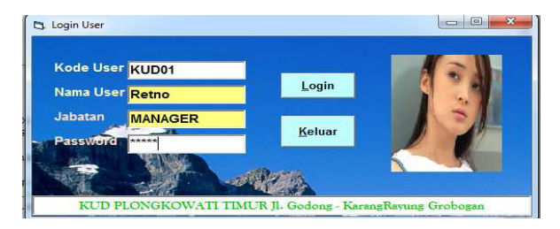
Login Display Image

To use the login form, users simply input their respective user code, then the user photo, user name and user position will automatically appear. Then the user must enter the password that each user has. If the password is correct, you will enter the main menu. If the password is wrong, you cannot enter the main menu until the password is correct.