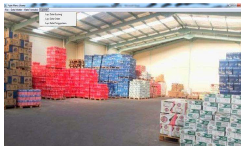
Main Menu Form Display Image

In the form there are several menus and sub menus including a file menu , master data menu , transaction data menu and report menu .