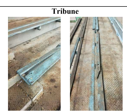
In the spectator stands, there was quite severe damage

It is visible in unwanted condition and there is some damage to the sides of the Tower.