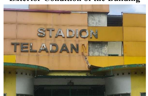
The condition of exterior shroud of the building looks unkempt and has been damaged in some parts.