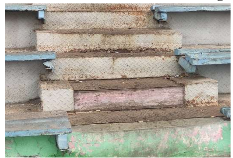
The condition inside of the building looks poorly maintained and has damage in some parts.

Based on the results of a survey of existing infrastructure in the Teladan Stadium area, it can be concluded that improvements and even changes are needed so that they can be enjoyed by visitors to the Teladan Stadium. And therefore the renovation plan for the Teladan Stadium is very feasible so that the role of the Teladan Stadium as the proud stadium of Medan City can be returned and optimized.