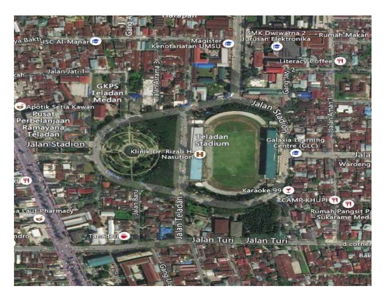
Figure 2. Road Infrastructure and Accessibility

Teladan Stadium in Medan can be accessed from 4 sides. It is surrounded by Stadium Street which can be accessed directly from Sisingamangaraja street. This makes the Exemplary Stadium very strategic and very easy to access.