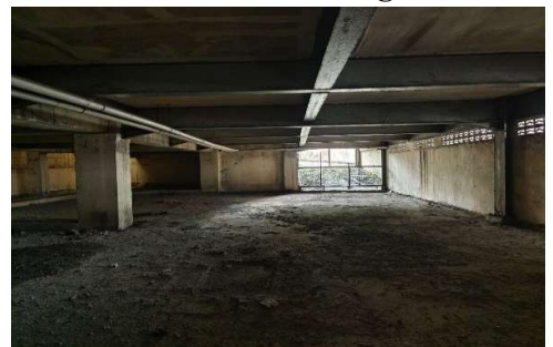
The parking area is very unwanted and very dirty, deserted and unused because it does not follow the standards and is difficult to use.